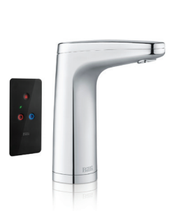
Sahara Under-Bench Unit